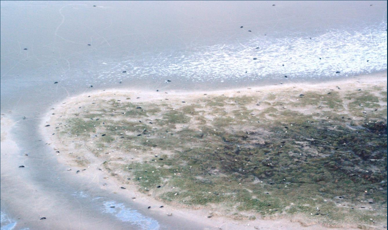
Photo: The Richel in the Netherlands holds by far the largest breeding colony in the Wadden Sea area. White dots are young pups, adult and newly weaned animals are darker animals. S. Brasseur.