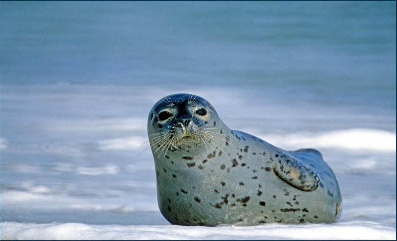
Photo: Harbour seal in shallow waters.